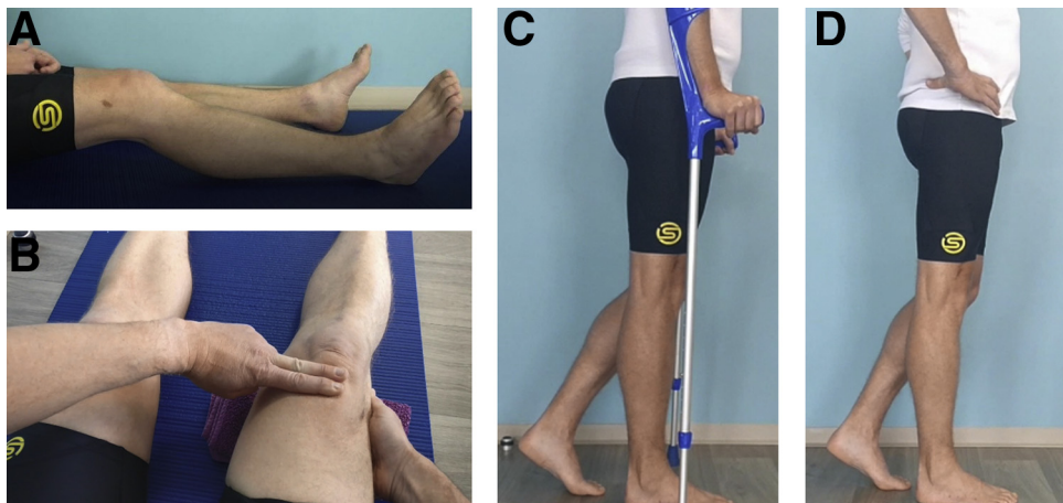
Fig 2. Clinical assessment. (A) Presence of a flexion contracture \geq 5^\circ . (B) Good quadriceps isometric activation assessed by ascension of the patella. (C) Good quadriceps locking with no flexion contracture at the maximum extension phase during gait with crutches. (D) Good quadriceps locking with no flexion contracture at the maximum extension phase during gait without crutches.

that he had mastered the movements, and I felt the app was not diversified enough.